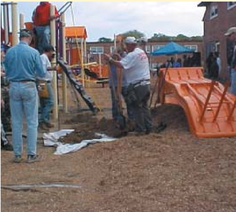
Volunteers work diligently to complete the new playground.