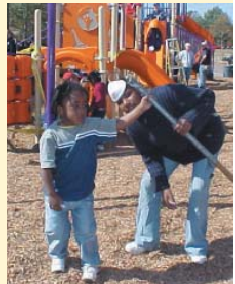
A young volunteer takes a break from working on the playground build.