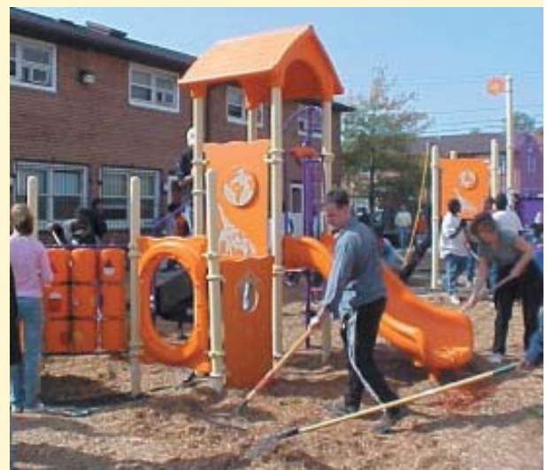
All in a day's work!