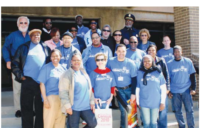
DCHA staff members pose for a group photo before heading out to the properties.

The 2010 Census aims to count all U.S. residents-citizens and noncitizens alike. To accomplish this, the Census Bureau delivers a short, 10-question form to every household in America and requires that you fill in the form to account for everyone living at your address as of April 1, 2010. Then mail it back in the prepaid envelope as soon as