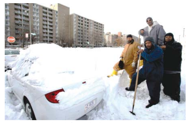
Workers take a break from digging out a DCHA vehicle.

The success in these back-toback storms can be attributed to DCHA's fleet personnel who kept snow blowers, Bobcats and trucks with plows or spreaders operating throughout the storms and traveled