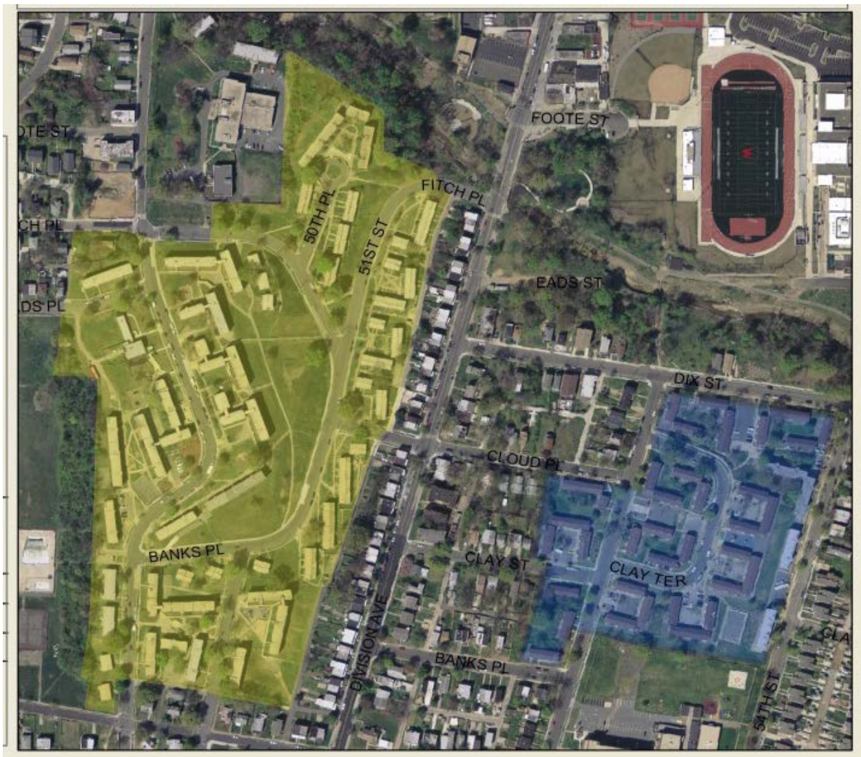
Aerial Map of Lincoln Heights (Yellow) & Richardson Dwellings (Blue). This RFQ is for the redevelopment of the Lincoln Heights site only.